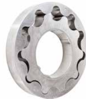
GEAR SET OIL PUMP