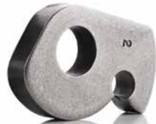
SEAT HEAD REST*